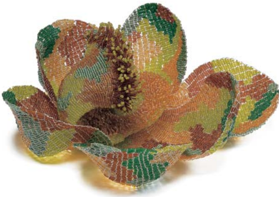
Understorey (detail) 1999–2004 Glass beads, silver wire 170 x 140 x 75cm installed Collection: The artist Courtesy: Roslyn Oxley9 Gallery, Sydney

Understorey is an intensely coded sculptural installation in vibrant salmon pink, lively orange, deep blood red and the acidic greens of tropical camouflage. The work can be read as a tropical memento mori , exploring the struggles over life and death in many contemporary postcolonial societies. Exquisitely crafted from glass seed beads, it literally knots together beauty and death.