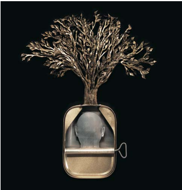
Ficus religiosa ; bo-gahal (Sinhala); aresu (Tamil); bo tree 'Paradisus terrestris' (Sri Lankan series) 1999 Aluminium tin 36 x 18 x 4cm Collection: The artist