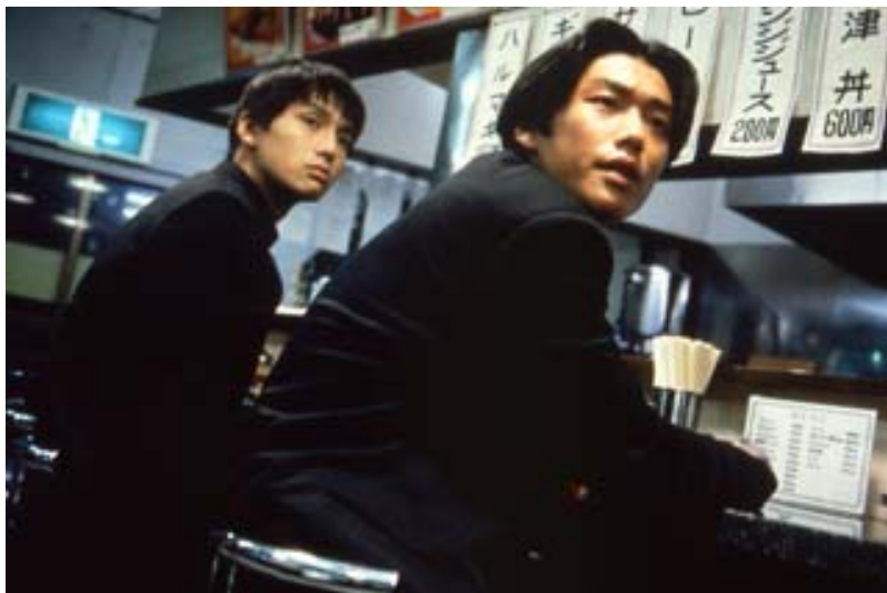
Image: Production still from Kids Return 1996 / Director: Takeshi Kitano